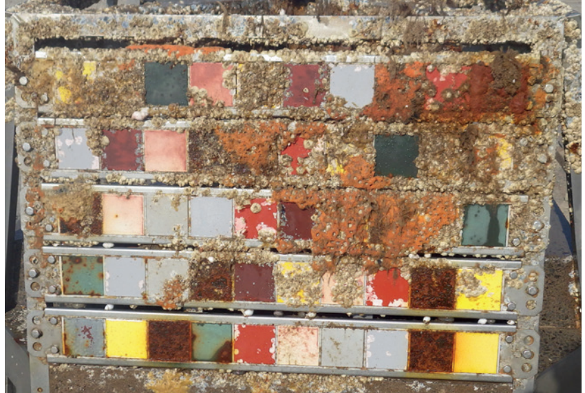
Photo right: Test rig after 5 year tidal stream trial off Orkney. Panels treated with Coppercoat (the five dark green panels) remained the cleanest and lost the least thickness.

In a recent 5-year trial conducted by Plymouth Marine Laboratory Applications Ltd (PML) on behalf of EDF Energy, a wide variety of anti-foul coatings were tested for longevity and efficacy. To quote the report published in March 2018: “After 60 months of testing, Coppercoat was the best performing coating.”