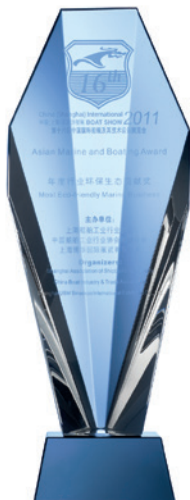
Photo below: Environmental award in recognition of helping to reduce the environmental impact of boat ownership. Coppercoat received the “Most Eco-Friendly Business Award” at the China International Boat Show, the 1st antifoul company to receive such an accolade.

This concern follows on from a BCF statement in the December 2016 Digest 107: