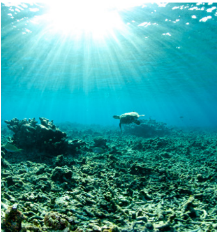
Photo above: Coral bleaching caused in part by sea temperature increase and oceanic acidification.

Such inevitable, long overdue changes leave Coppercoat as the most viable, low leach rate, efficacious and environmentally responsible bio-active anti-foul available.